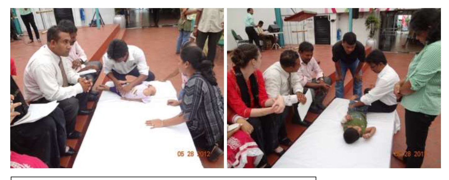
Assessment and awareness camp at Excel World, Colombo on 28<sup>th</sup> May 2012