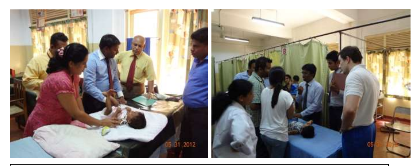
Assessment and awareness camp at Physiotherapy Department, Kandy General Hospital on 31st May 2012