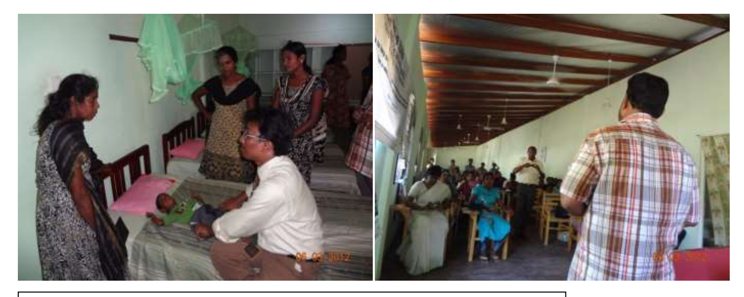
Assessment and awareness camp at on Karuna Nilayam, Killinochchi 3rd June 2012

Assessment and awareness camp at Nursing School Hall, Jaffna on 2nd June 2012